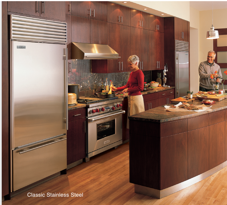
Classic Stainless Steel

One of our most popular units, the Model 650 offers large refrigerated storage, plus the convenience of a handy freezer drawer with an automatic ice maker. The Sub-Zero dual refrigeration system assures superior food preservation and no odor transfer. Model 650 is available in the framed, overlay and stainless steel design applications and in three stainless steel finishes.